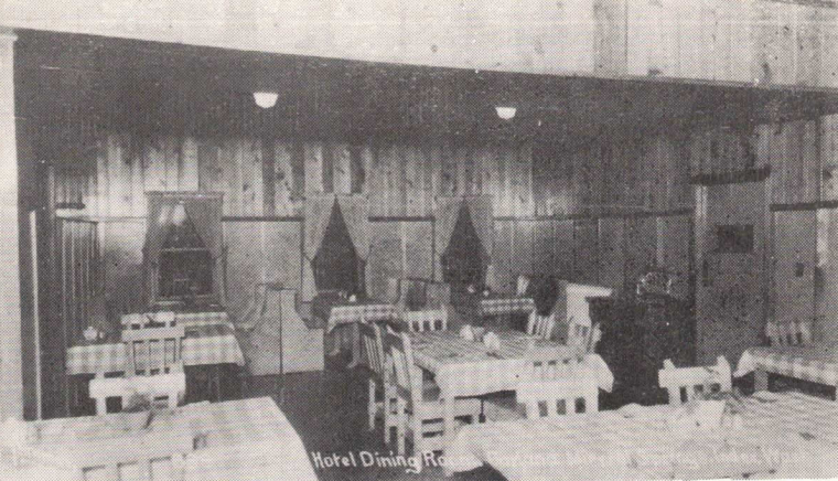
Hotel Dining Room