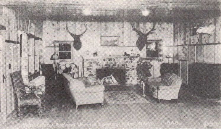
Hotel Lobby, Garland Mineral Springs, Index, Wash. 843